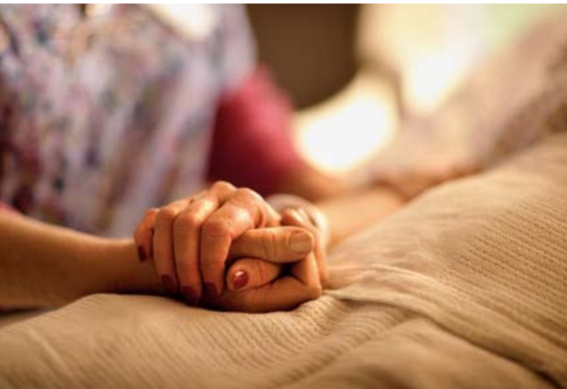
The UNM Cancer Center is home to New Mexico's largest team of cancer experts, and our physicians provide cancer care that is unmatched in the state.

NCI designation is a highly competitive process involving extensive annual reviews by top cancer experts and a site visit every five years. In 2005, the UNM Cancer Center achieved NCI designation, a major milestone for the Center and for cancer care in New Mexico. In 2010, the NCI re-designated the UNM Cancer Center, affirming our national leadership in cancer care and research. As a result of this process, we can proudly say that we provide the most comprehensive, state-of-the-art cancer care available in New Mexico.