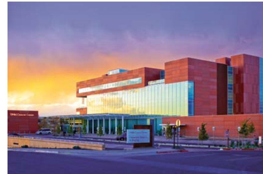
The UNM Cancer Center offers world-class cancer treatment and a full range of support services in a beautiful and hopeful healing environment.

In 2009, the UNM Cancer Center opened its $100 million, 206,432 square-foot, state-of-the-art cancer research and treatment facility in Albuquerque. This beautiful new home offers patients the latest cancer treatments and technologies in a serene, welcoming environment. Designed around the idea of treating the whole patient, the building features healing gardens, art alcoves and a meditation chapel. There is ample space to accommodate our array of patient and family support services, which complement and enhance cancer treatment. Sunlight, natural materials and healing colors create a warm environment; our chemotherapy infusion suite on the top floor offers a stunning view of the Sandia Mountains. All of these features reflect our belief that healing is a journey involving all aspects of a person's being.