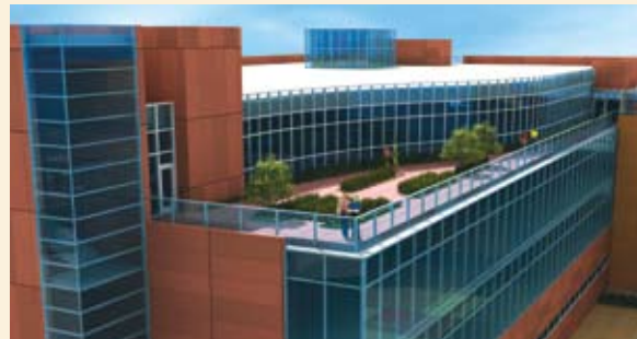
Rooftop Healing Garden

The Center's Infusion Suite features a Rooftop Healing Garden where patients can receive chemotherapy treatments outside in the fresh air while enjoying a stunning panoramic view of the Sandia Mountains.