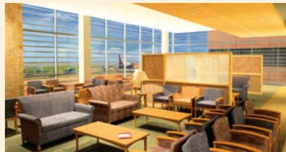
Clinic Waiting Room

Tranquil spaces to allow families quiet areas for discussion and reflection.