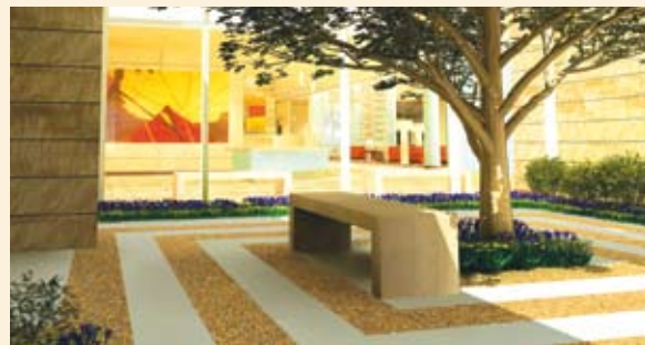
Healing Garden & Pool

Located next to the Center's main entrance and graced by a meditation pool, stone benches and plants, this secluded garden provides a quiet spot for contemplation. It also serves as an outdoor gathering space for events at the Education Center.