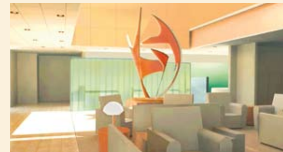
"Spirit of the Wind" by Allan Hauser, depicted here in our Main Lobby/Atrium, is representative of art appropriate for the new building. © 1992 Chiinde LLC