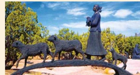
"Homeward Bound" by Allan Hauser is representative of art appropriate for the new building. © 1989 Chiinde LLC